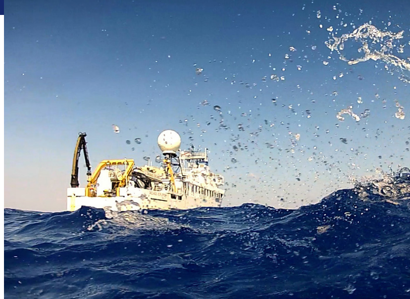
The (E/V) Nautilus at sea in the Gulf of Mexico

NOAA has also supported experiments to explore the sensitivity of key coral taxa to OA, including those that support local fisheries. NOAA continues to conduct sustained, long-term measurements of the chemical progression of OA and associated biological and ecological impacts in and around coral reefs. OA monitoring on reefs throughout the Caribbean has been a highly collaborative activity with numerous academic, government, and . Despite these efforts, significant gaps remain that are crucial to the conservation and management of economically important marine resources within the region.