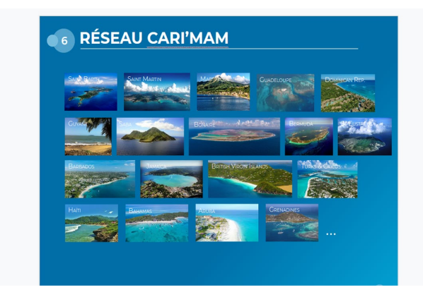
Figure 1. The CARI'MAM network from all the Caribbean region